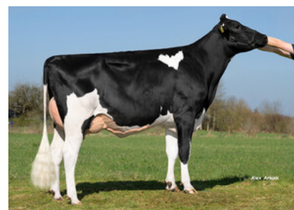
M: SHS Estland