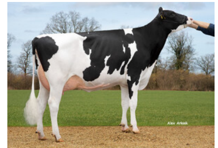
M: THI Riverdance P RDC