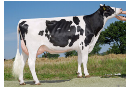
Norgard XY-Ting Bookem Camil