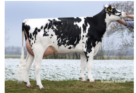
M: KHE Izmir