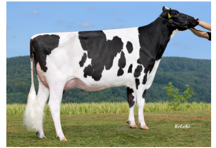
MM: Nosbisch Holsteins Amalia