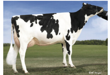
5. M: Clear Echo M-O-M 2150