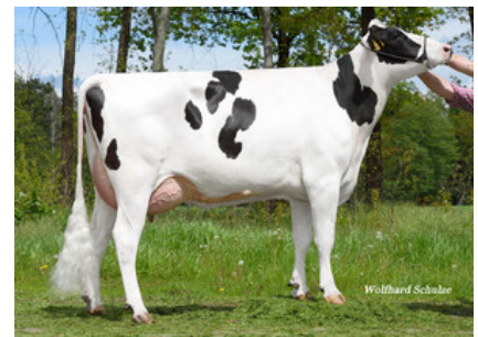
M: WEH Isabella